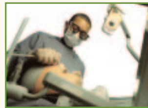
USC's famous Sim-Lab